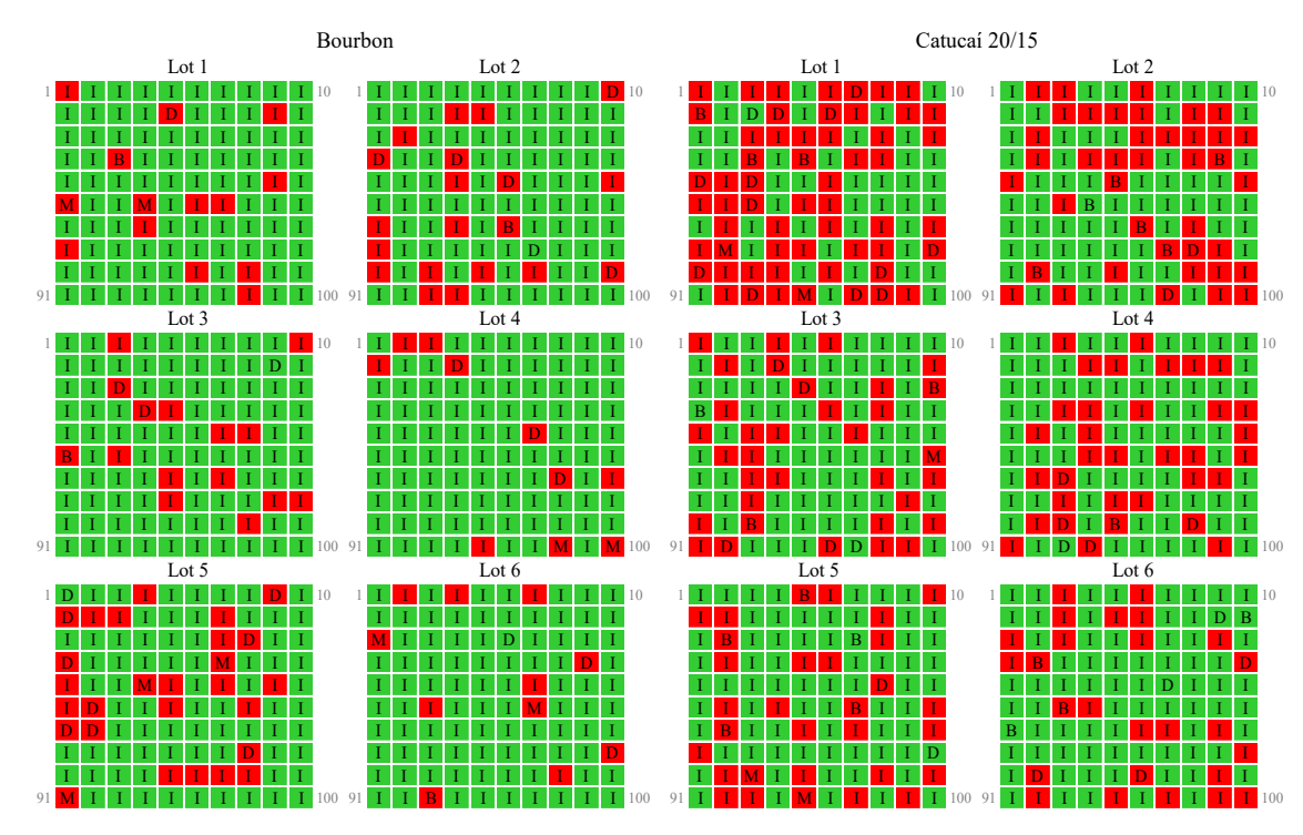
Figure 2. Relationship between intact seed (I), malformed seed (M), seed with deteriorated tissues (D) and seed with injuries caused by the coffee borer (B) identified by radiographic analysis with normal seedling (green) or seeds not germinated (red), in six seed lots of the cultivars Bourbon and Catucaí 20/15.

By adjusting the logistic regression model, we verified the association of the factors (lot, cultivar and classification) with the germinate performance. The models