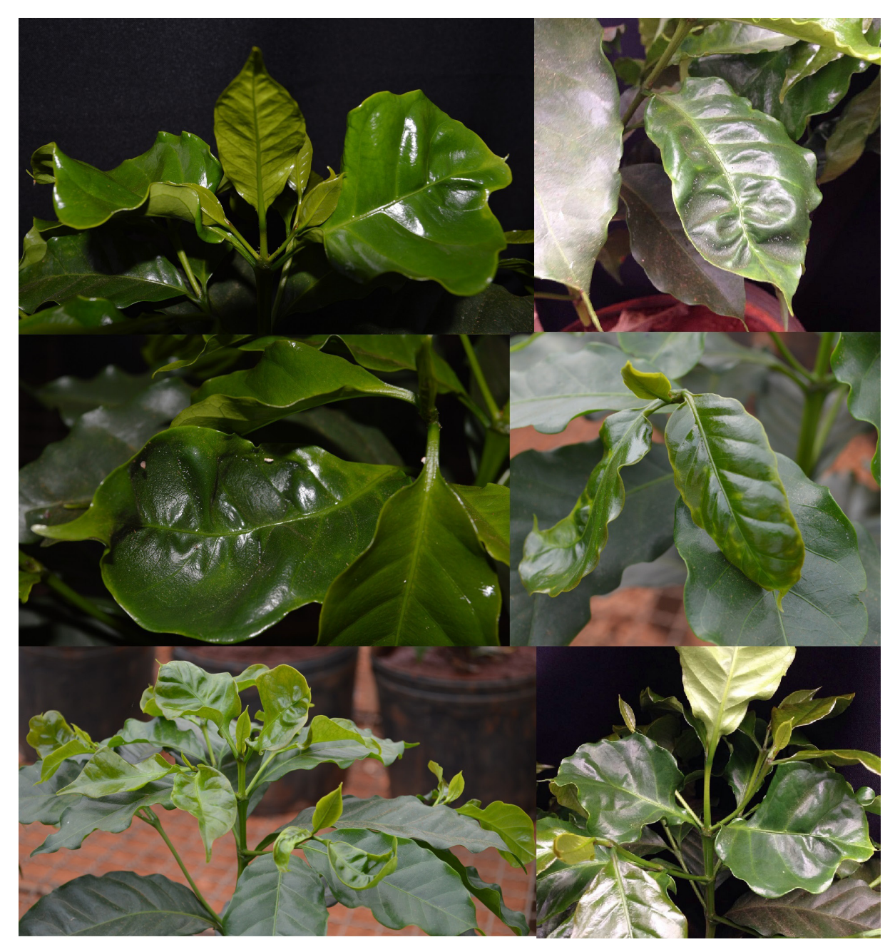
FIGURE 1 - Leaf cracking and deformation in growing regions of coffee submitted to the simulated drift of herbicide Chlorimuron ethyl 10 days after application.

The inhibition of plant metabolism as a function of the application of this herbicide is known to prevent amino acid formation, reducing plant growth (RODRIGUES; ALMEIDA, 2018). However, some studies using Chlorimuron ethyl show herbicide selectivity to crop and no phytotoxicity up to 37.5 g.ia.ha<sup>-1</sup> (ANZALONE, 2014). Furthermore, it is emphasized that this dose represents the commercial dose of the herbicide